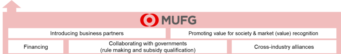
Fig. Collaboration Framework