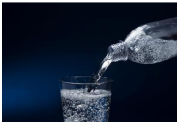
MX Nylon ® used as a barrier layer of PET bottle