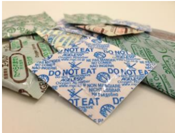
Oxygen absorber “AGELESS ® ”