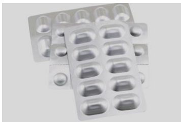
OxyVanish-D™ Blister (Under development)